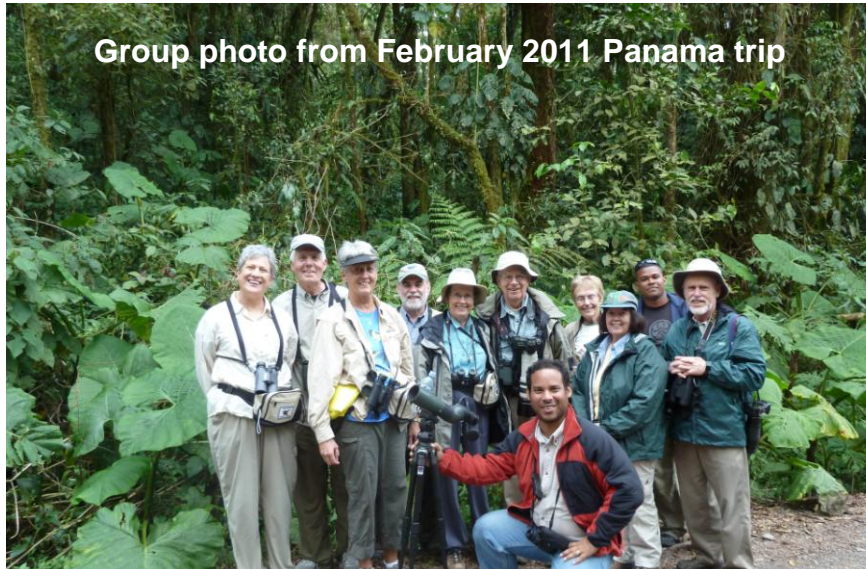
Group photo from February 2011 Panama trip

Apr 2011 - Canopy Tower/Lodge Aug 2011 - Peru Nov 2011 - Ecuador Dec 2011 - Amazon Extension