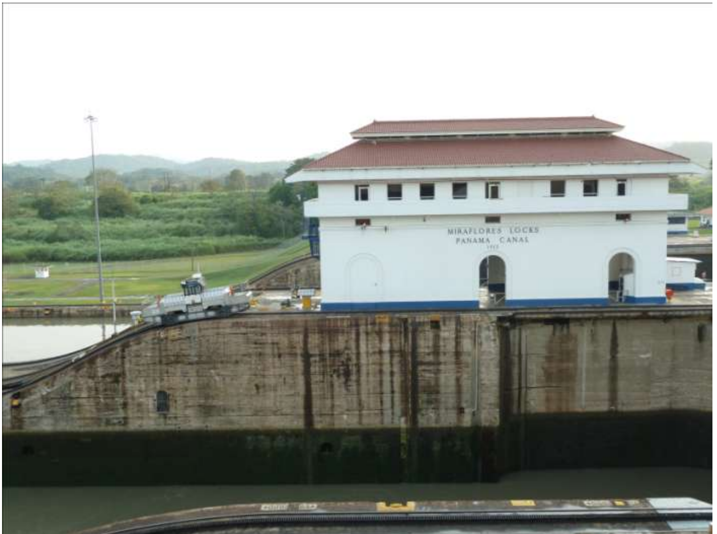
Miraflores Locks, Panama Canal