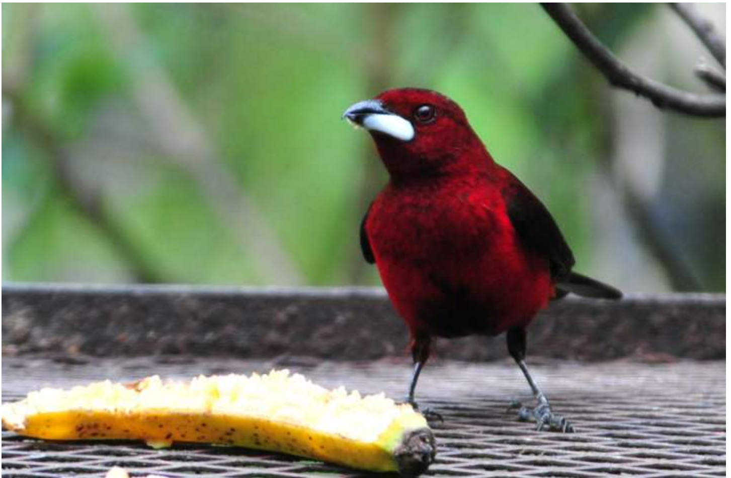
Crimson-backed Tanager at Canopy Lodge feeder