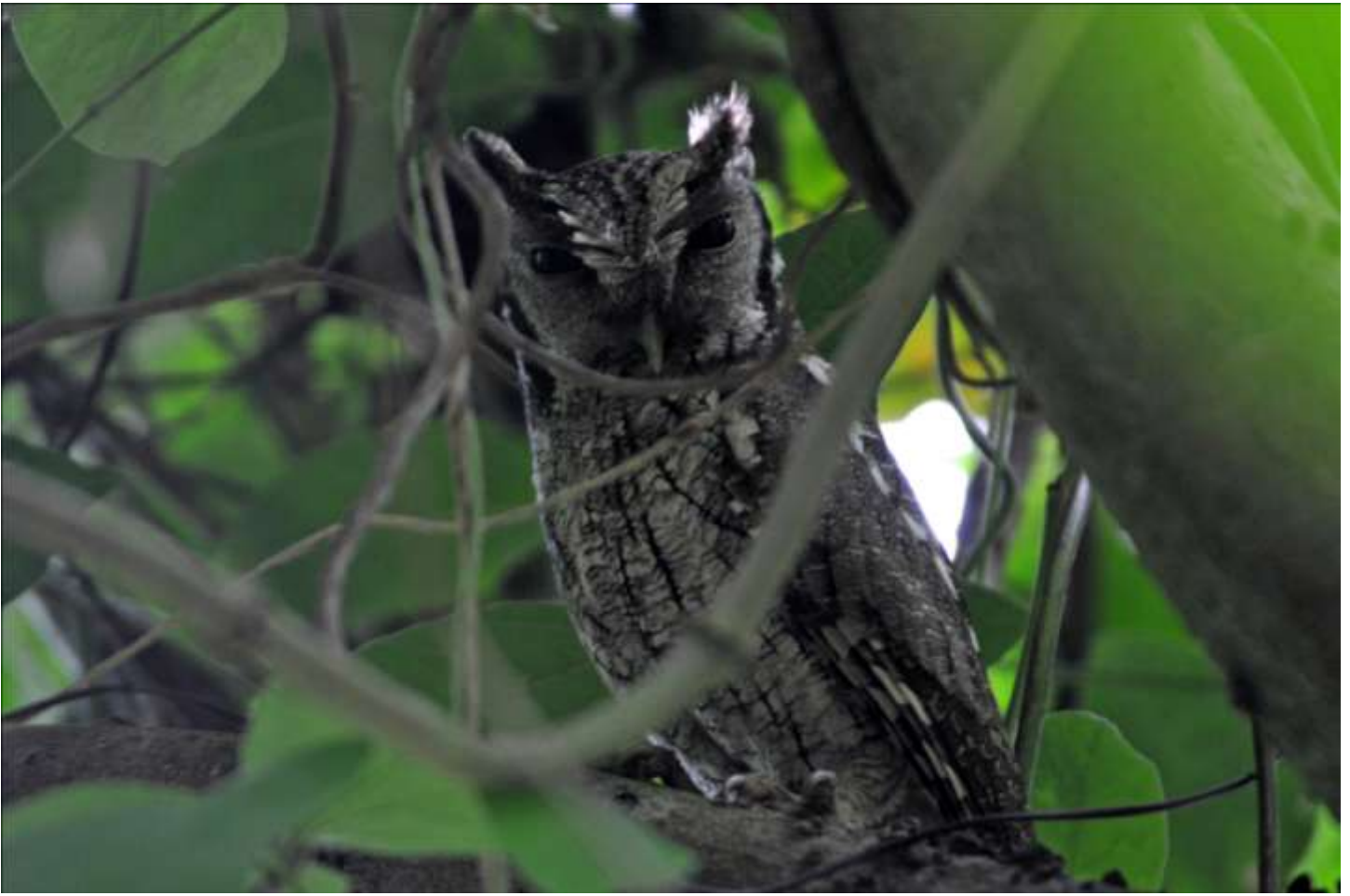
Tropical Screech Owl