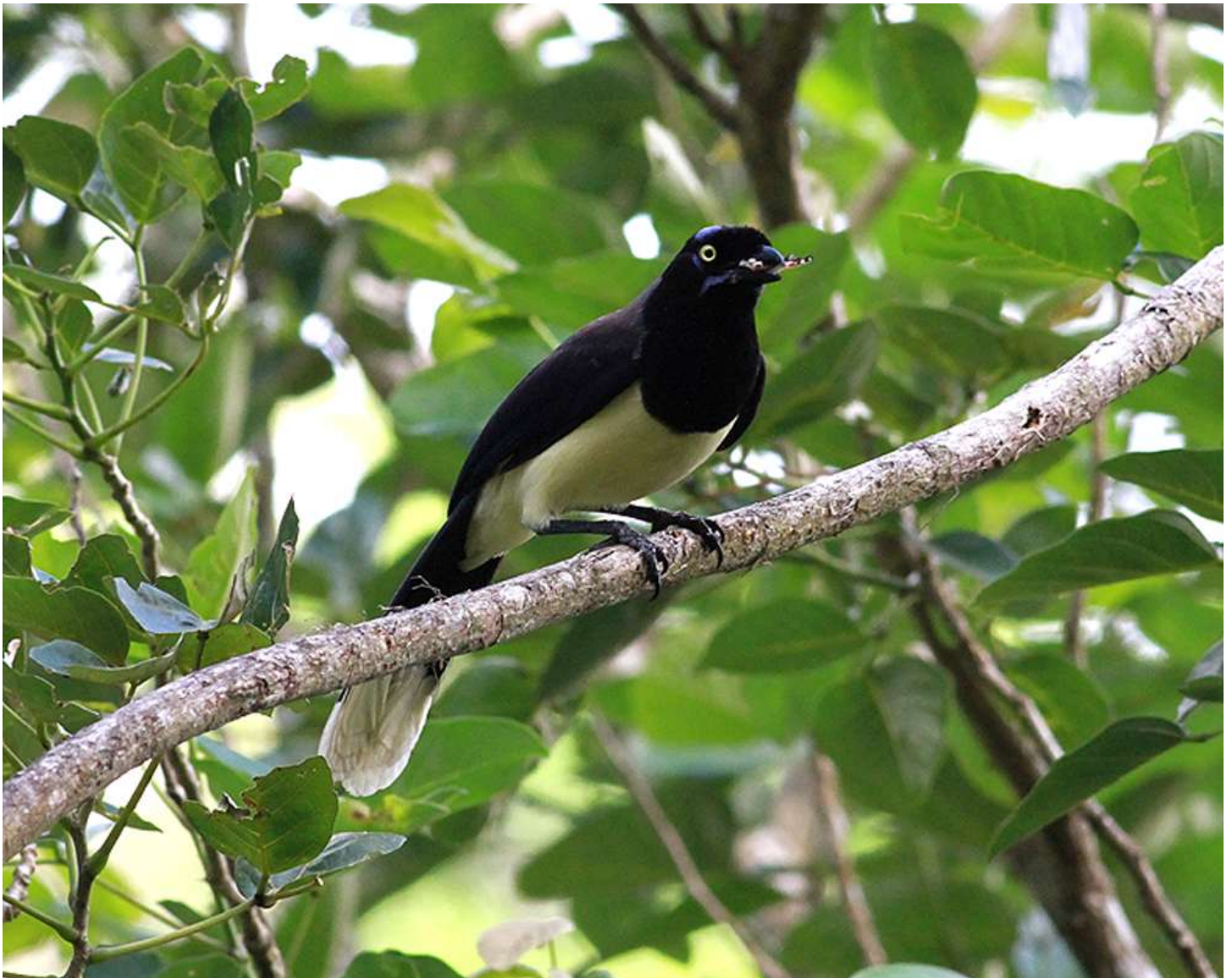
Black-chested Jay

We returned to the lodge at around 5:00 PM and compiled our list before dinner. 108 species (WOW!) for the day with another 7 species heard only. Our trip total now stood at 306 species.