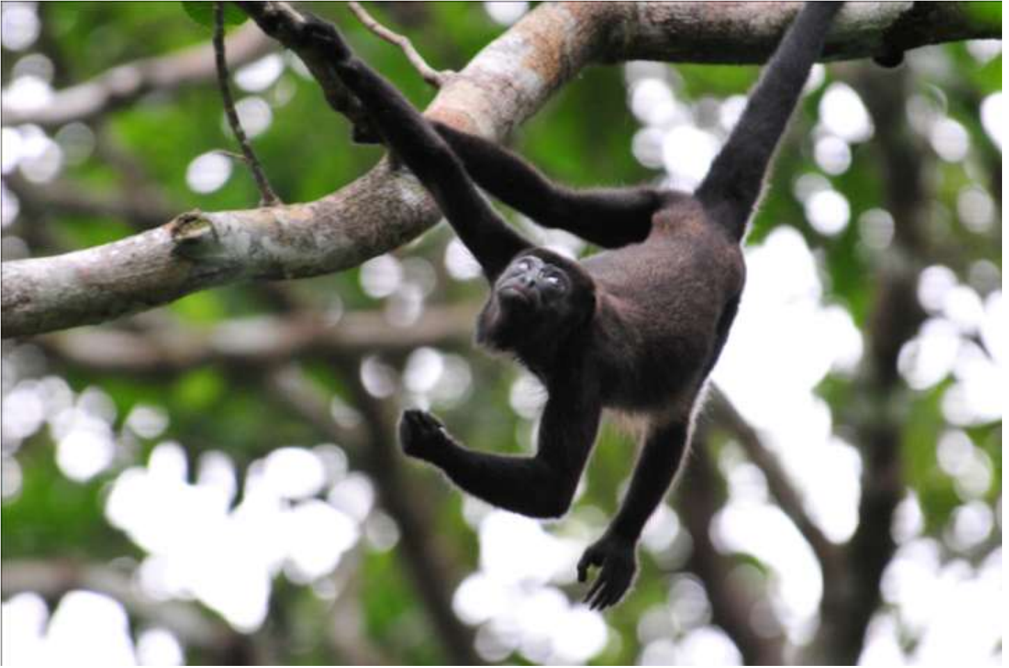
Howler Monkey juvenile

As Carlos crossed one of the small wooden bridges, we came to an abrupt and violent stop, momentarily tossing some of us out of our open-air seats in the back. There had been a large board, probably a 6 x 6, lying on the bridge, and when Carlos drove over it, it popped up, hitting the underside of the bumper and lodging there to stop forward movement when the other end became lodged against the floor of the bridge. Hernando was following us at this point, and he immediately saw what needed to be done to free the Bird-mobile. After a few moments we were moving again, with no real harm done to either birders or Bird-mobile.