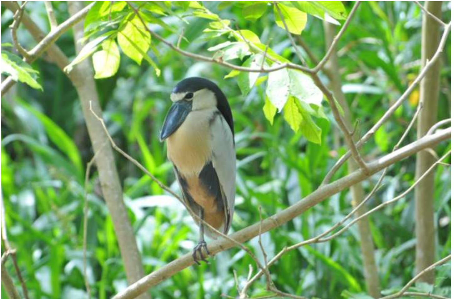
Boat-billed Heron (photo taken in Belize, 2010)

At this point, it started sprinkling lightly and we moved on. Going back down the hill, Carlos spotted a Black-tailed Flycatcher but it vanished before anyone else could see it. As we approached the ponds, a Fulvous-vented Euphonia was seen. Now approaching 10:00 AM, the light rain continued and we all got our rain gear out. At the ponds, we found Spectacled Caiman floating lazily. One of our primary target species for this area, Boat-billed Heron , was found on the far side of the south pond. Three species of Kingfisher are possible here, and we found two of them, Green Kingfisher and Amazon Kingfisher .