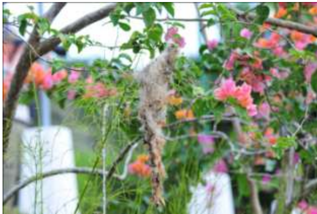
Common Tody-Flycatcher nest

At the bridge, we saw Fork-tailed Flycatcher , which only one person had seen on an earlier day, and Mangrove Swallow , a bird we had probably already seen but not taken the time to identify prior to this morning. When we arrived at the Marina, the first bird we saw was another Common Tody-Flycatcher building its pendulous nest in a flowering bush just a few feet off the ground. Because of the slope of the ground, we could stand and look at the nest at eye level or move a bit and actually look down on the nest and the activity around it. As this is one of my favorite species, I spent some time trying to get some decent photographs.