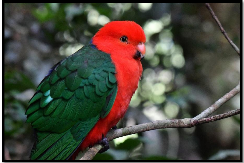
Australian King Parrot

Overnight O'Reilly's Rainforest Retreat. (BLD)