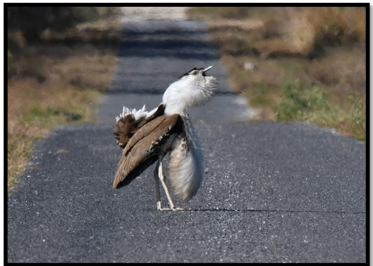
Australian Bustard displaying

Kingfisher Park Birdwatchers' Lodge, on the northern edge of the Tableland, caters exclusively to birders. Within the grounds are Wompoo Fruit-Dove, Emerald Dove, Noisy Pitta, Red-necked Crake, Buff-banded Rail, Sooty Owl, Black-faced Monarch and an array of honeyeaters. Nearby is Mount Lewis, covered in upland rainforest where we hope to find a range of species endemic to North Queensland including Mountain Thornbill, Golden Bowerbird, Tooth-billed Bowerbird, Chowchilla, Spotted Catbird, Fernwren, Graceful and Bridled Honeyeater, Bassian Thrush and Pale-yellow Robin . Back down the mountain at Sides Road the targets are Blue-faced Parrot Finch, Lovely Fairy-wren and Grey-headed Robin .