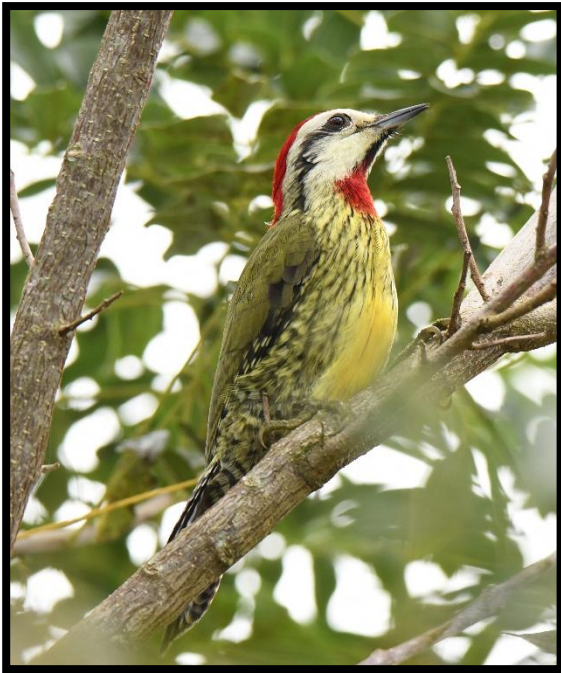
Cuban Green Woodpecker

This morning we plan to visit Parque El Cubano with a local expert guide. This field trip offers an opportunity to visit one of the best national parks in the region and is less than half an hour from Trinidad. Target Species: Cuban Pygmy-Owl ,