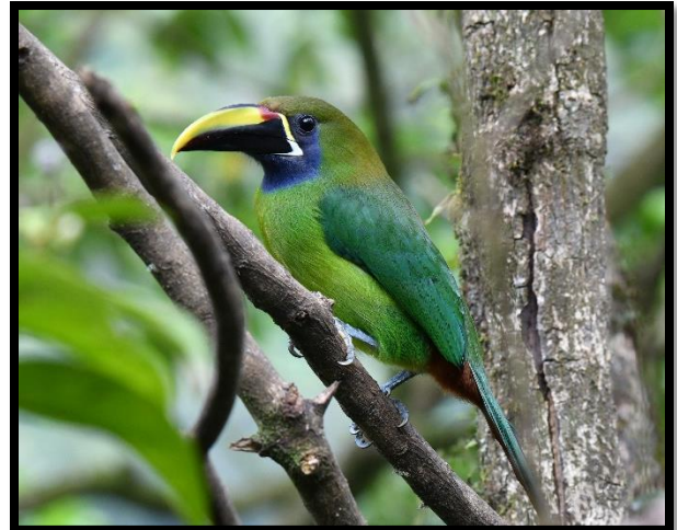
1Northern Emerald Toucanet

By afternoon, we'll reach our destination: La Selva Biological Station, where research projects are carried out on every conceivable aspect of the tropical forest system. We'll check in to our comfortable but basic (no AC or wifi in the rooms) lodging at the Biological Station, situated at the edge of the forest and connected by a wooded path to the main area of the reserve where the dining room and interpretive center are located. Time permitting, we'll do a bit of birding after arrival, either as a group or on our own near the cabins. Perhaps at the dinner table a young researcher will be glad to discuss their own studies with you.